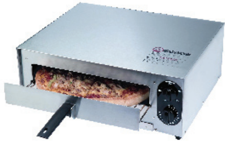
Model: CP012 UPC: 814387010190